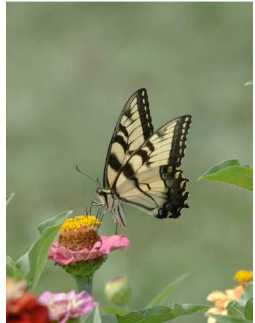
Vegetables and a Welcome Visitor at the Brightside Community Gardens

A great deal of information about the gardens including photo albums, layouts, rules and regulations is available on the citizens' web site at http://www.charlestown.org . Simply click the square "Garden" icon near the top of the Home page. All supplies and materials for the gardens have been provided by Charlestown Township. The gardens were built and are maintained by volunteers who do the mowing, weed-wacking and fence patching. "Weed bins" are provided where gardeners should deposit the weeds from their plot, and each year gardeners have had free cow manure and free hay mulch for their use. Gardeners are expected to keep their plot from "going to weeds". In some cases, two families share a plot and share the workload of maintaining it.