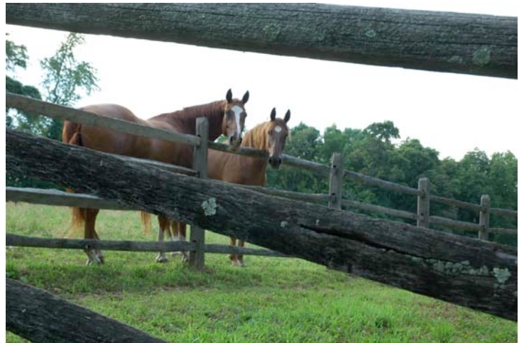
Two happy residents of Glomar Farm