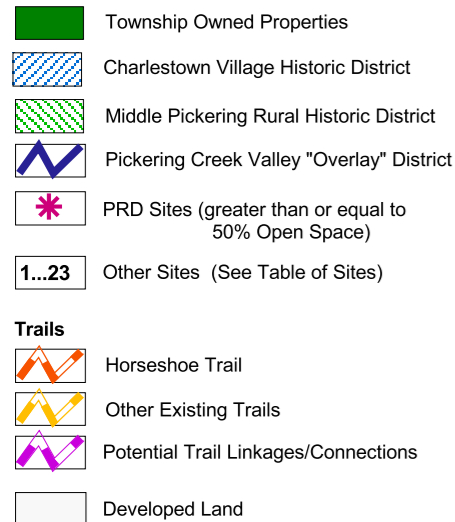
Table of Sites