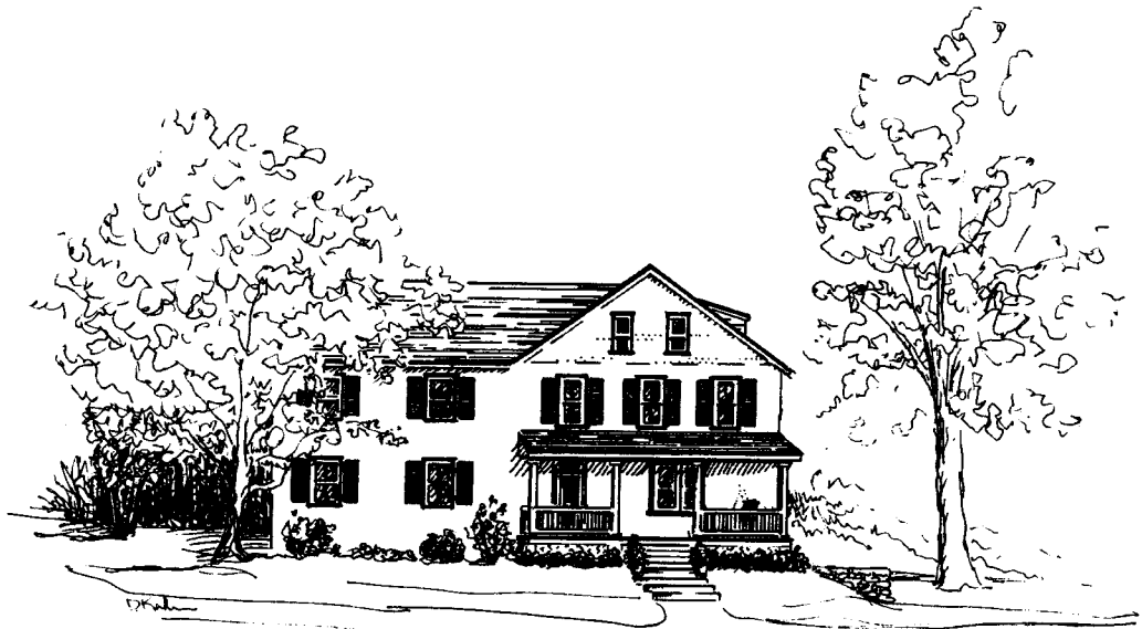
MARSHALL'S HALF HILL FARM