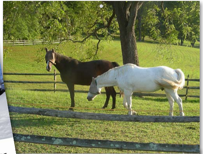
June - The southwest portion of Charlestown Township has a cluster of at least 8 farms, a mix of strictly private farms and several that provide boarding facilities and/or riding lessons and occasionally host shows. depicts two contented residents of a farm on Green Lane and Foster Roads. At the right, horses eat around the buttercups at Rainbows End along Yellow Springs Road.